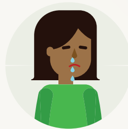
Runny or stuffy nose